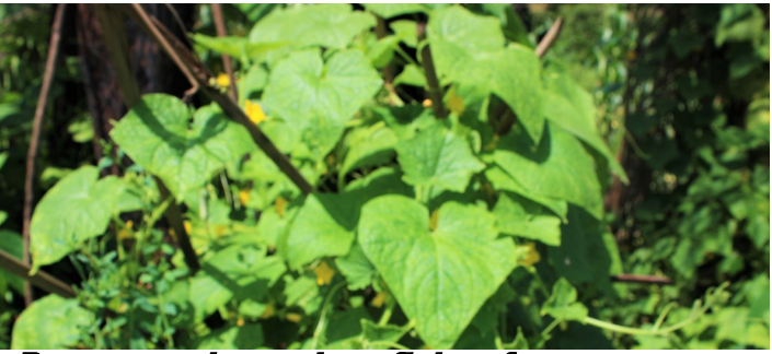
Beans growing on beneficiary farm