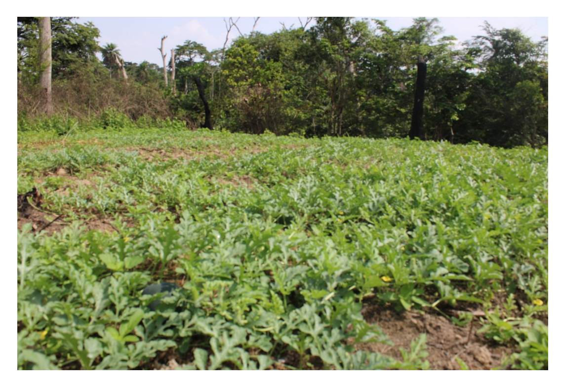
Vegetable garden in Lofa