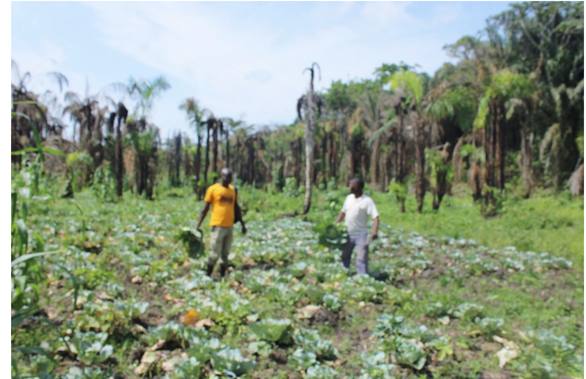
Harvesting cabbage in Kpain, Nimba County